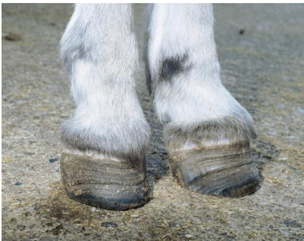
Fig 3 rings of abnormal hoof tissue which diverge towards the heels

Never leave a lame donkey until tomorrow. Lameness means pain! Prompt diagnosis and appropriate care can be a life saver.