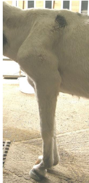
Fig 2 muscle wastage in shoulder area