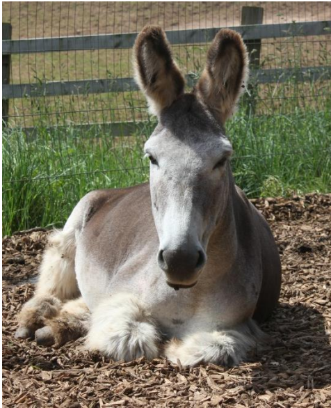
Fig 1 increased lying down